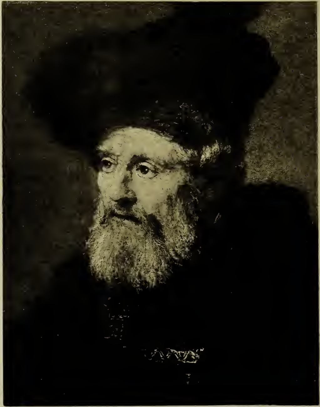
Menasseh ben Israel. from a portrait by Rembrandt now in the Hermitage Collection, St. Petersburg